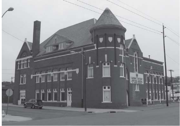
Central Police Station - 701 Messanie Street

1890, and signed by Ellis as delineated in 1890. The St. Joseph Daily News in October 1891 stated that the building, which cost about $20,000, was almost ready to occupy.<sup>13</sup>