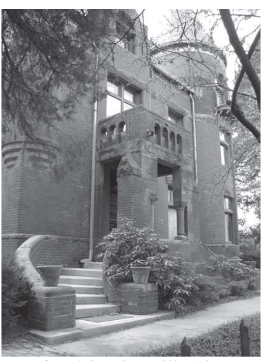
Alfred T. Smith Residence - 802 Hall Street