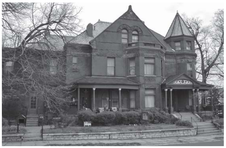
B. F. Vineyard Residence - 1125 Charles Street