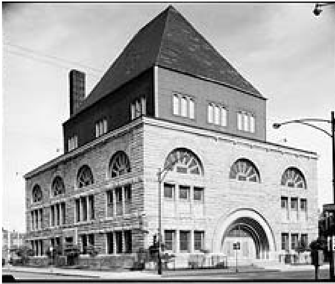
Pilgrim Baptist, 1964

The Bronzeville neighborhood surrounding the synagogue began to change in the early twentieth century; the Jewish population disappeared and African-Americans became the dominant ethnic group. In 1922, the African-American Pilgrim Baptist Church purchased the building. Pilgrim Baptist's music director was Thomas A. Dorsey, a prominent figure in the development of American gospel music. The church was in the midst of putting a new roof on the landmark when on January 6, 2006, a roof torch started a fire that completely destroyed almost everything save the limestone walls of the building. What the congregation lacked in cash it made up for in good will. Donations allowed for stabilization of the walls, and earlier this year the church announced that it had hired the architectural firms Johns & Lee Ltd. and Quinn Evans to begin drafting plans for reconstruction. The cost of rebuilding, not known but likely over $10 million, may prohibit full restoration, although Landmarks Illinois is optimistic that the selection of Quinn Evans will lead to a respectful design.