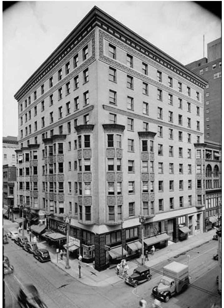
The Victoria Building