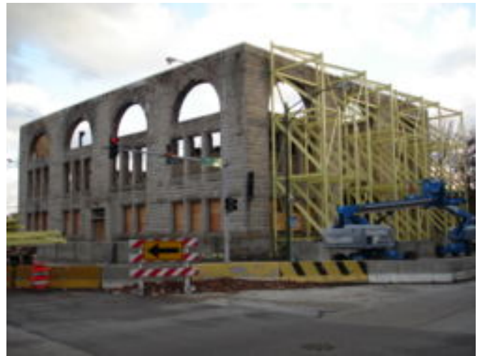
Pilgrim Baptist, December 2006

Completed in 1891, the Kehilath Anshe Ma'ariv Synagogue at 3301 S. Indiana Avenue was one of Sullivan’s most important works in his partnership with Dankmar Adler. The imposing synagogue consisted of a three-story base of Bedford limestone surmounted by a recessed fourth story topped by a dramatically steep hipped roof. This upper structure was actually the top of the open auditorium. A massive arched main entrance was wide and low, suggesting a cavern entrance into a mighty rock-hewn structure. The arch pattern was repeated on the third floor windows. Ornate terra cotta spandrels with foliage motifs added further decoration to the base. The building benefited from the imposing nature of its broad form as well as the tension between its heavy earthbound stone base and its shingled upward-pointing top. The interior space was likewise imposing. The auditorium featured a curved balcony on three sides under a massive arched ceiling. Adler’s triumph, the plaster ceiling, was suspended from large wooden trusses in the hipped roof on top of the building.