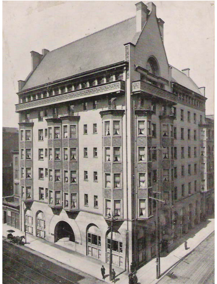
"St. Nicholas Hotel, Adler, Sullivan & Ramsey, Architects" from the Souvenir of the 29 th Annual Convention of the American Institute of Architects, held at the hotel in 1895.

the Victoria Building would stand on its own merit and not on its relationship to the St. Nicholas Hotel. The remodeled building was to represent the work of Eames and Young and no one else.