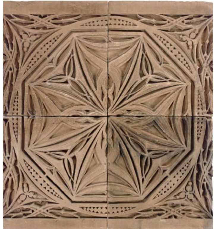
An example of the so-called "Snowflake" spandrels on the bay windows. These four pieces, possibly not all from the same spandrel, were auctioned on December 18, 2007 at Christie's, New York, where they brought $34,600 (Sale 1942, Lot 276).

els delineated the edges and center of the shaft and suggested pillars of support for the balconies above. Since form follows function, the hotel rooms that had oriels or balconies also had private bathrooms.