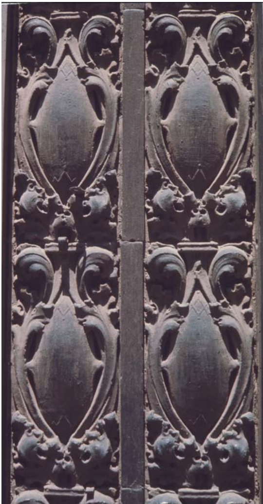
Ground floor decorative panels from the Victoria Building.