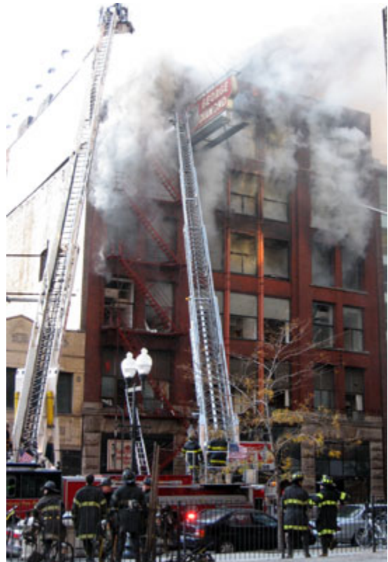
Wirt Dexter Building, October 24, 2006