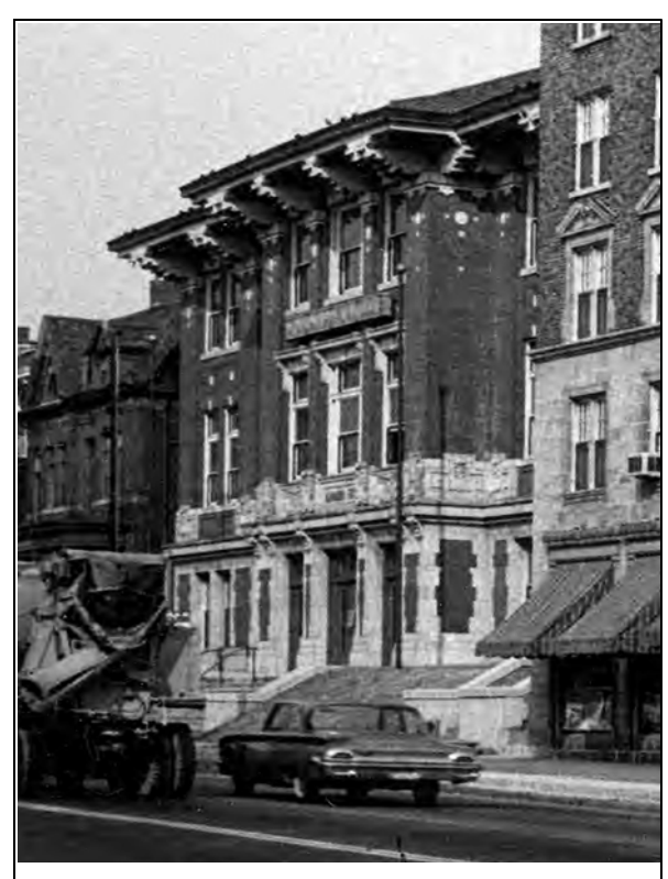
The Liederkranz Club, 2626 South Grand, in 1964